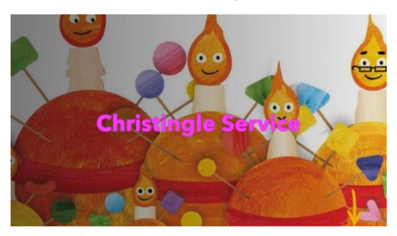
Don't forget to join us this afternoon for our online Christingle service as we celebrate Jesus Christ – Light of the World!

Material taken from BCP © Representative Body of the Church of Ireland and Common Worship © Church of England.