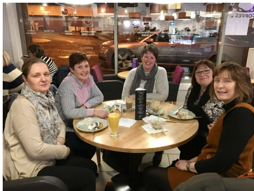
Treats at 'Frolick'