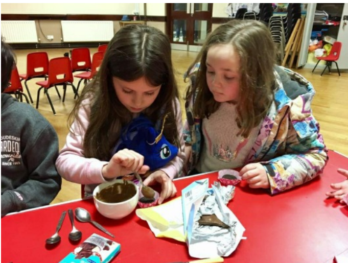
Making Valentine cookies

In Sunday School we will be starting the CMS project 'Growing in God'. Each child will receive a tube of Smarties to collect 20 pence pieces. There will be collection boxes at the back of the church for anyone else who would like to support the project.