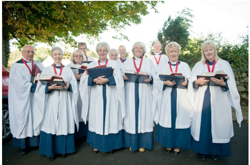
St Patrick's choir attend Ballyclug Harvest