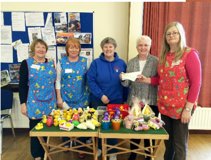
St Patrick's Mothers and Toddlers recently selling knitted Easter items in aid of Radio Cracker