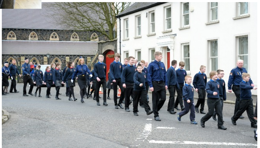
St Patrick's Church Lads' and Church Girls' Brigade Battalion Parade on Sunday 13th March